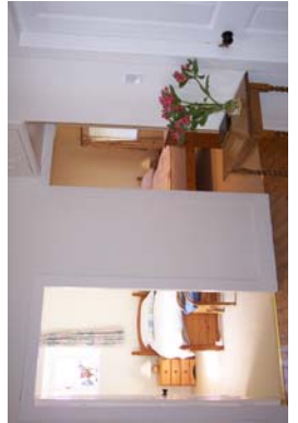
Hallway & Bedrooms